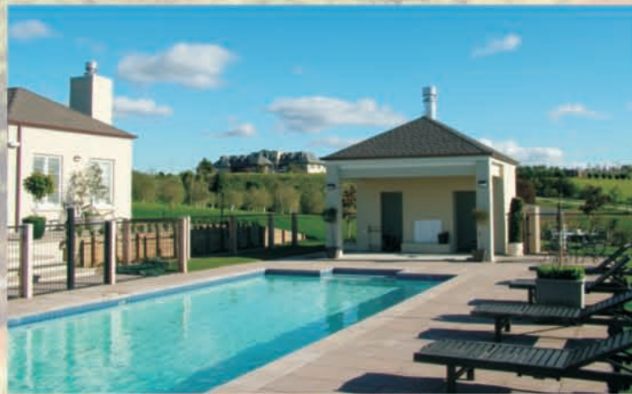
Dairy Flat, Auckland, New Zealand