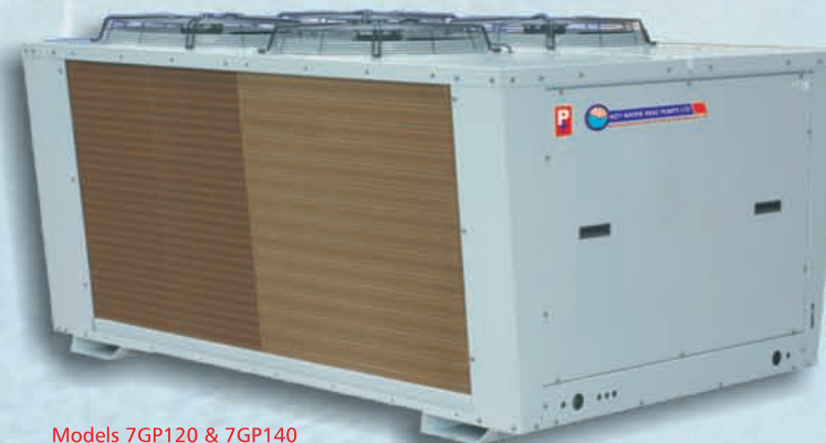
Models 7GP120 & 7GP140