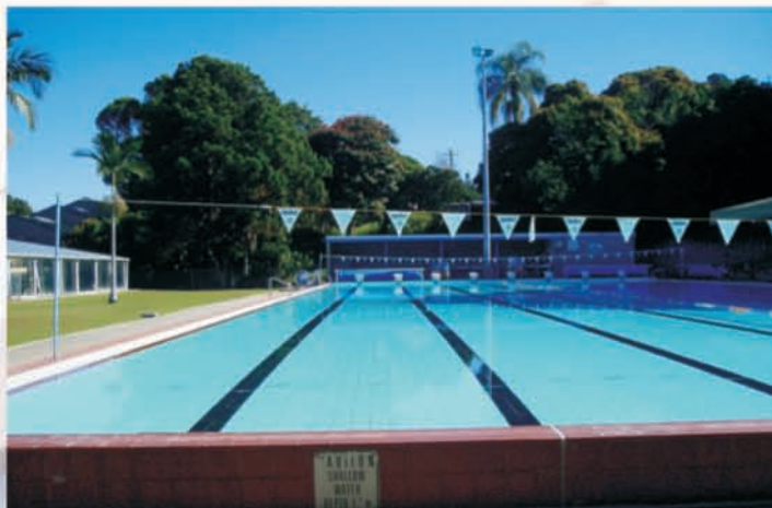
Nambour Olympic Pool - Sunshine Coast, Queensland, Australia