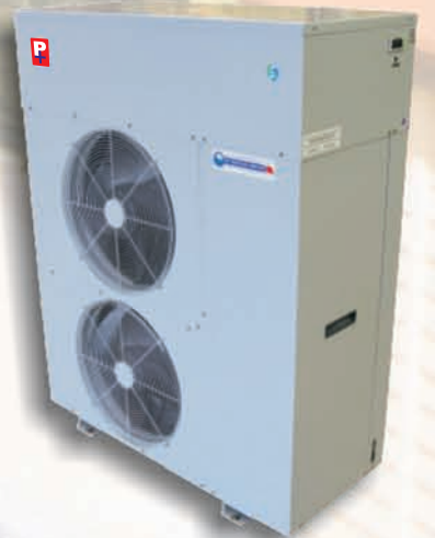
Models 7GP23 to 7GP25

Performance Plus Heat Pumps are durable and versatile. They can safely operate in ambient temperatures from -10°C to +45°C. This is possible using technology developed by Hot Water Heat Pumps.