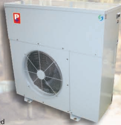
Models 7GP7 to 7GP20